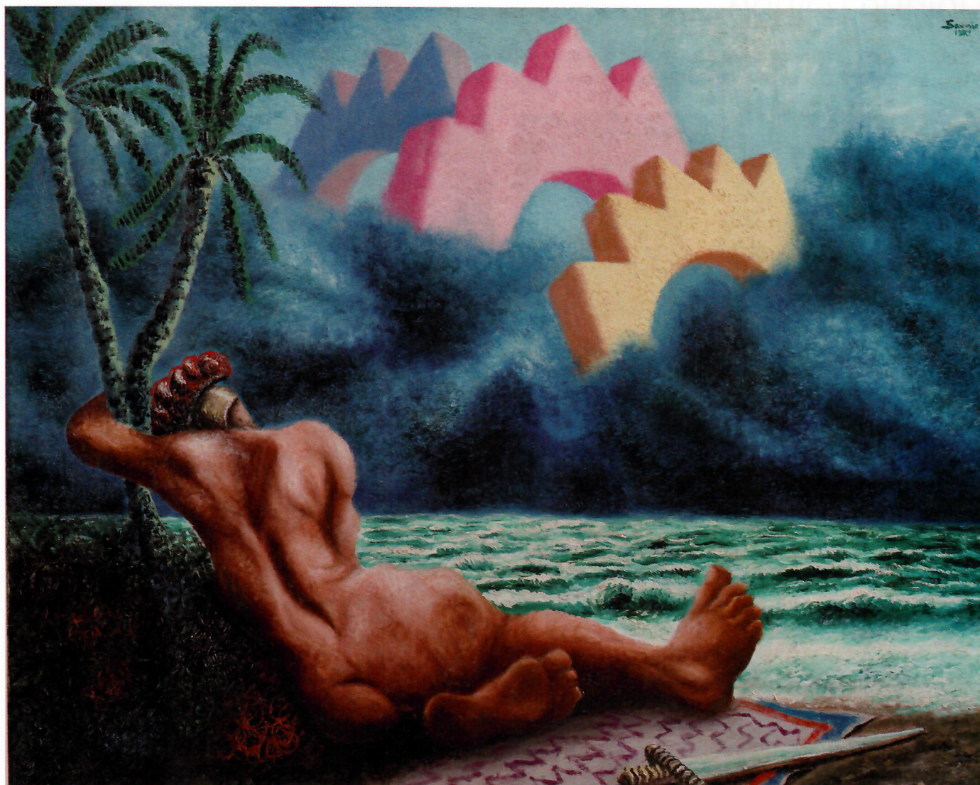
Le songe d'Achille (The Song of Achilles), 1929.

reproduce this essence in its complete genuineness is the highest aim of art.” Citing one of the earliest Greek philosopher-scientists, he continued, “Heraclitus says that Nature loves to conceal herself....In painting irony occupies a most important position, once the mind of the artist achieves the maximum degree of clarity. Then he perceives exactly the original precision of nature.”