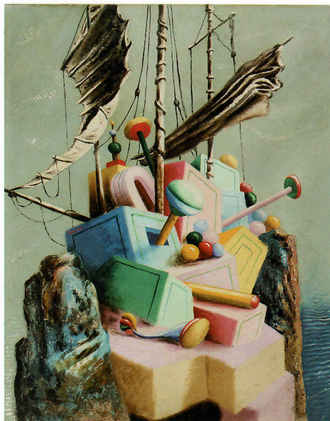
Clockwise from top left: Jour de reception (Reception Day), 1930; Le navire perdu (The Lost Ship), 1928; L'île des Charmes (The Charmed Island), 1928.

was born in Greece of a noble Genoese family in 1891. The pseudonym Alberto Savinio, which he adopted in 1914, was an attempt to distinguish himself from his brother, who was three years older, although the two were very close at the beginning of their careers and only much later had a falling out. Or so it seems. The exact nature of their relationship is hard to determine, but whatever the case may be, Savinio was always very much his own man. Unlike de Chirico, who was a visual artist and art theorist, Savinio was not only a painter and a critic but a musician, composer, fiction writer, essayist, journalist, playwright, and set designer.