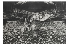
Giulio Paolini Arianna , 1982 Photo emulsion on canvas Private Collection