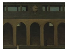
Giorgio de Chirico L'énigme de l'heure [The Enigma of the Hour], 1910-1911 Oil on canvas Private Collection