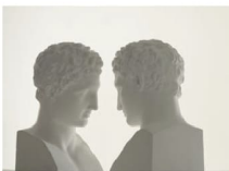
Giulio Paolini Mimesi [Mimesis], 1975 Plaster casts with matte white bases Fondazione Giulio e Anna Paolini, Turin, Italy