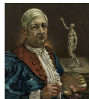
Giorgio de Chirico Autoritratto con tavolozza [Self-Portrait with Palette], 1954 Oil on canvas Galerie Andrea Caratsch, St. Moritz, Switzerland