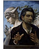
Giorgio de Chirico Autoritratto con testa di Mercurio [Self-Portrait with Head of Mercury], 1923 Tempera on canvas Private Collection