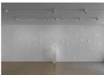
Giulio Paolini Melanconia ermetica [Hermetic Melancholy], 1983 Pencil on paper, plaster cast, collage on wall, matte white basis The Rose Collection and The Rachofsky Collection