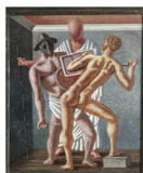
Giorgio de Chirico Gladiateurs [Gladiators], 1928 Oil on canvas Nahmad Collection, Monaco