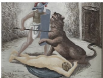
Giorgio de Chirico Gladiateurs et fauves / La douce mort [Gladiators and Beasts / The Sweet Death], 1927-1929 Oil on canvas Nahmad Collection, Monaco