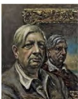
Giorgio de Chirico Doppio autoritratto in cornice [Double Self-Portrait in Frame], 1955 Oil on canvas Galerie Andrea Caratsch, St. Moritz, Switzerland