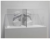
Giulio Paolini Doppia verità [Double Truth], 1995 Plaster casts, Plexiglas cases with mirrored side, matte white base The Collection of Barbara Bluhm-Kaul and Don Kaul, Chicago, USA