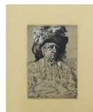
Giorgio de Chirico Se Ipsum [Himself], 1948 Ink and gouache on paper Giulio Paolini Collection