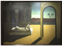
Giorgio de Chirico La ricompensa dell'indovino [The Soothsayer's Recompense], 1913 Oil on canvas Philadelphia Museum of Art: The Louise and Walter Arensberg Collection, 1950