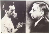
Giulio Paolini Contatto [Contact], 1969 Photo emulsion on canvas Private Collection