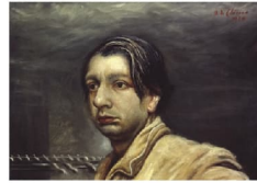
Giorgio de Chirico Autoritratto [Self-Portrait], 1924 Tempera on canvas Private Collection, Courtesy Galleria dello Scudo, Verona, Italy