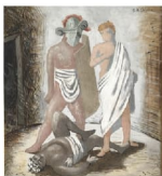
Giorgio de Chirico Gladiateurs / L'inutile victoire [Gladiators / The Useless Victory], 1927 Oil on canvas Nahmad Collection, Monaco