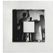
Giulio Paolini Anna-logia [Anna-logy], 1966 Primed canvases, photo emulsion, nylon monofilament Private Collection