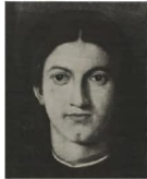
Giulio Paolini Controfigura (critica del punto di vista) [Stand-in (A Critique of the Viewpoint)], 1981 Photo emulsion on canvas Fondazione Giulio e Anna Paolini, Turin, Italy