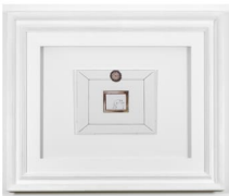
Giulio Paolini Interno metafisico [Metaphysical Interior], 2009-16 Collage on paper in Plexiglas frame, white painted wood frame, and pencil and collage on wall Collection of the Artist