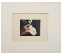
Giulio Paolini Et quid amabo nisi quod aenigma est? [What Shall I Love if Not the Enigma?], 1969-70 Collage on paper Collection of the Artist