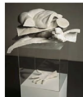
Giulio Paolini Ante litteram [Ahead of Its Time], 1985 Plaster casts, Plexiglas case, matte white base