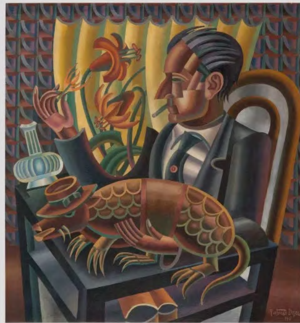
Figure 2. Fortunato Depero, "Gianni e l'armadillo" [Gianni and the Armadillo], 1946. Oil on canvas, 29 1/2 x 27 9/16 in. (75 x 70 cm).