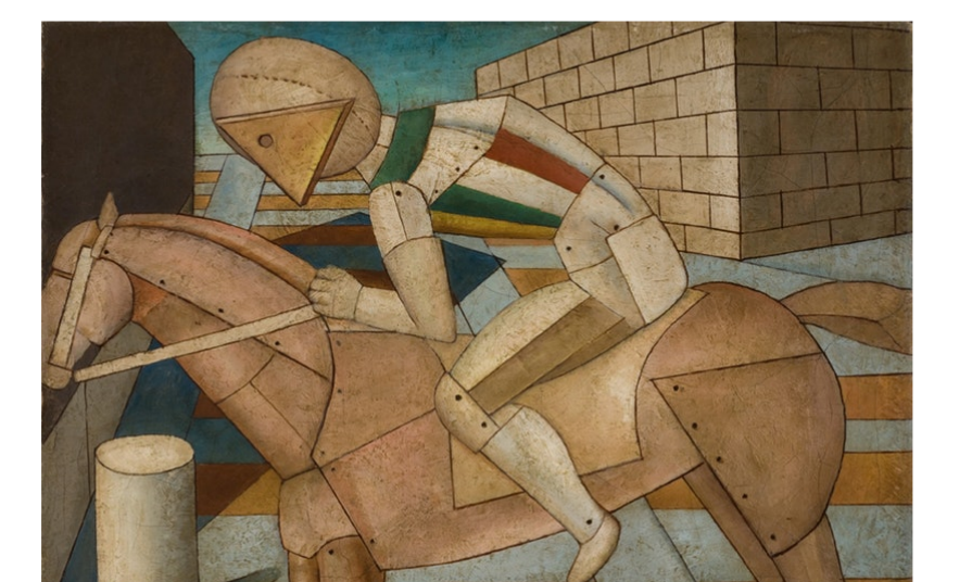
Carlo Carrà, Il cavaliere occidentale (The Western Knight) , 1917, Oil on canvas, 52 \times 67 cm, Fondation Mattioli Rossi, Switzerland.

Metaphysical painting deploys a stock of devices—mannequins, mirrors, shadows, and geometrical objects—developed by Giorgio de Chirico in the strange, philosophically oriented paintings he created in Paris before World War I. Designed to suspend everyday awareness, it also reacts against the progressive avant-garde of the early 20th century. There's a postmodern impulse in de Chirico's irony, his fusion of classicism and nascent surrealism. Less known are other artists who contributed to pittura metafisica after the War, but Metaphysical Masterpieces 1916 – 1920: Morandi, Sironi and Carrà offers stunning, rarely seen works by three of the most prominent.