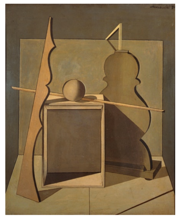
Giorgio Morandi, Natura morta (Still Life) , 1919, Oil on canvas, 56.5 x 47 cm, Pinacoteca di Brera, Milan, Courtesy of MiBAC, © 2018 Artists Rights Society (ARS), New York / SIAE, Rome.

Mario Sironi, who settled in Milan after his release from the army, worked longer than the others under the sway of Futurism's internal dynamics, extending its emphasis on the city and machinery in dense, dark imbroglios. Using newspapers as a collage substrate for his paintings grounds them in the everyday and endows them with the grittiness of urban life in the postwar era. Informed by his commercial work as a graphic designer and illustrator —the show includes prints of twenty covers he made in 1920 for Italian Factories Illustrated—Sironi's dramatic paintings of isolated trucks and automobiles in dark, empty squares echo de Chirico's melancholy. But if his mannequins, like Carrà's, assume virtual life and neoclassical robustness, the statuesque prostitute in Venus of the Ports (1919) and the spectral figure with empty eyes in The War (1919), allude as much to the physical conditions that led to the Fascist revolt as to metaphysical anomie; they lack the high irony and broad perspective which lends the other works in the show their special interest.