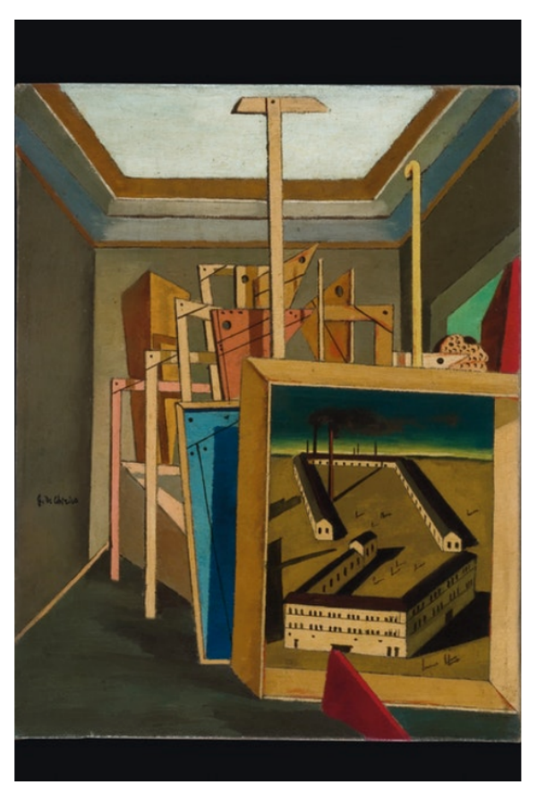
Giorgio de Chirico, Interno metafisico con piccola officina ( Metaphysical Interior with Small Factory ), 1917, Oil on canvas, 46 x 36 cm, Fondation Mattioli Rossi, Switzerland © 2019 Artists Rights Society (ARS), New York / SIAE, Rome.

A general mood of melancholy isolation prevails. Dynamic exuberance is replaced by methodical composition, as though fastidious fabrication could generate visions. Released from military service in 1917, Carlo Carrà was seeking new direction in the naïve realism of Henri Rousseau and the sturdy modeling of Giotto when he met de Chirico at a military facility for shell-shocked veterans in Ferrara. De Chirico's Metaphysical Interior (with Small Factory) (1917), which opens the exhibition, offers a literal take on the fragmented, abstracted planes of Cubism and Futurism, depicting wood panels tacked onto misaligned stretcher bars, arrayed in a studio interior around a painting of industrial buildings set in conflicting perspectives. All is portrayed with such clarity and conviction that the internal contradictions assume the force of a higher formal order-questioning, as dada artists did in more radical ways, any naïve faith in rationality. The handmade construction of Carrà's The Western Knight (1917) with its pegs and sutures, answers de Chirico's irony: an arrested freeze-frame in which the dynamic forward movement of Futurism is immobilized and compressed. Carrà's other paintings here have more in common with the naïve otherworldliness of Sienese painting than with Giotto, a fusion of neoclassicism and the surreal. In them, de Chirico's mannequins assume