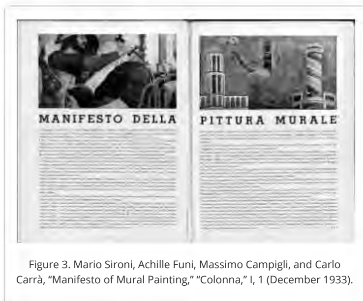
Figure 3. Mario Sironi, Achille Funi, Massimo Campigli, and Carlo Carrà, “Manifesto of Mural Painting,” “Colonna,” I, 1 (December 1933).

wanted to be modern and innovative in form and in the use of color, even as they took up traditional themes such as labor, maternity, daily life, and rural landscapes. After being applied in the plastic and figurative arts for about ten years, the style invaded the decorative arts and interior design, at which point it came to be considered commercial and, at times, even in bad taste. 10