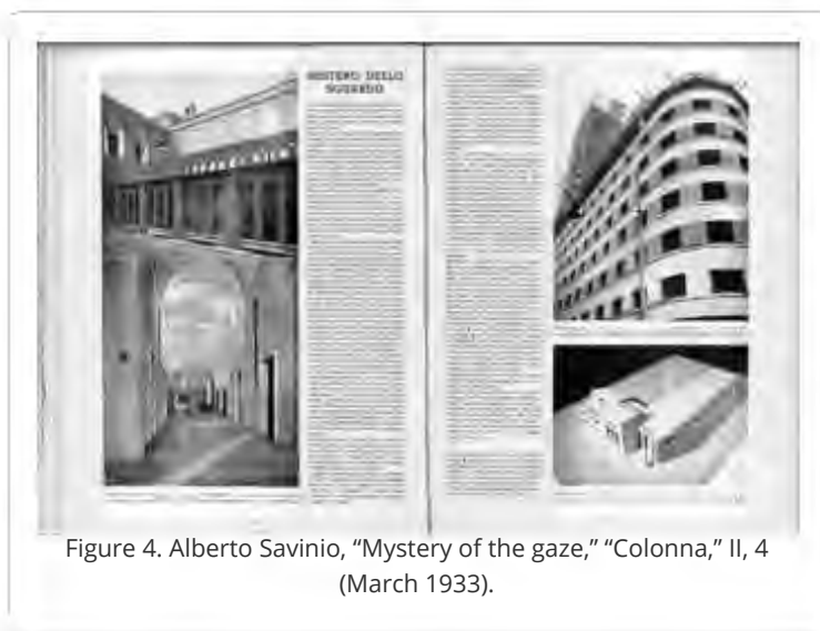
Figure 4. Alberto Savinio, “Mystery of the gaze,” “Colonna,” II, 4 (March 1933).

Colonna represents, therefore, a first, concrete experiment in a largely unexplored work in progress. And it is necessary to depart from this work in progress if we wish to reconstruct the figure of Savinio as an art critic and more in “the years of consent,” not giving in to easy judgments but rather adopting,