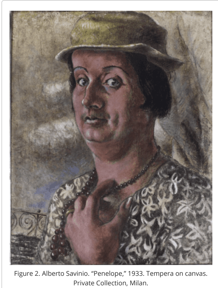
Figure 2. Alberto Savinio. "Penelope," 1933. Tempera on canvas. Private Collection, Milan.

myth. Penelope has two different functions in Savinio's production. The first is the one she has in Capitano Ulisse , where she is the negative counterpart of Ulysses and used by the playwright to carry out his own de-heroization of the myth. The second involves the canvases in which she is represented with a bird's head, where she is also an active part of the subversion. In these paintings, the peculiar representation of Penelope clearly signals a clash between ancient and modern and, likewise, between nature (represented by Penelope's head which refers to the animal origin of her myth) and culture (which manifests in the bourgeois setting, as well as Penelope's dresses and pose). This point is comprehensible if one bears in mind the close relation that exists among Savinio's various works: the models in his paintings may be seen as theatrical characters, with his Penelopes performing the new masques of his metaphysical theater, while the great importance given to captions, scenic designs (sketched by Savinio himself), and drawings (by his brother Giorgio de Chirico) inserted throughout the text demonstrate that Savinio's theater is extremely visual. 14