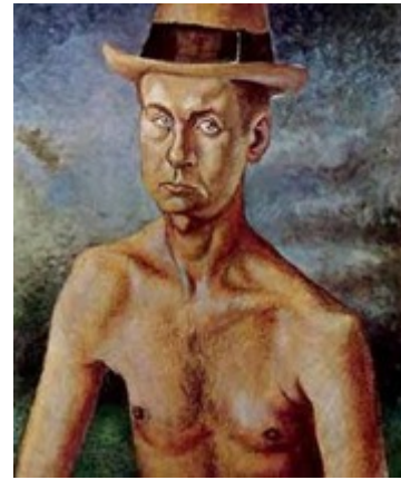
Figure 3. Alberto Savinio, “Il ritorno di Ulisse” [The return of Ulysses], 1933. Tempera on canvas. Private Collection, Rome.

Being named shapes the destiny of things and people: Penelope’s nickname designates her being. Names and naming are central points of Savinio’s oeuvre, as is evidenced by his creation of a personal dictionary, his Nuova enciclopedia (New encyclopedia, 1977). Myths and words are therefore in a synonymic relationship, and within his theater Savinio shows it not only in Capitano Ulisse but also in other plays, such as his later theatrical work Alceste di Samuele , where he associates the words classico (classic) and gabinetto (toilet). 18 Savinio’s originality lies in assigning to the ancient a word coming from an impoverished