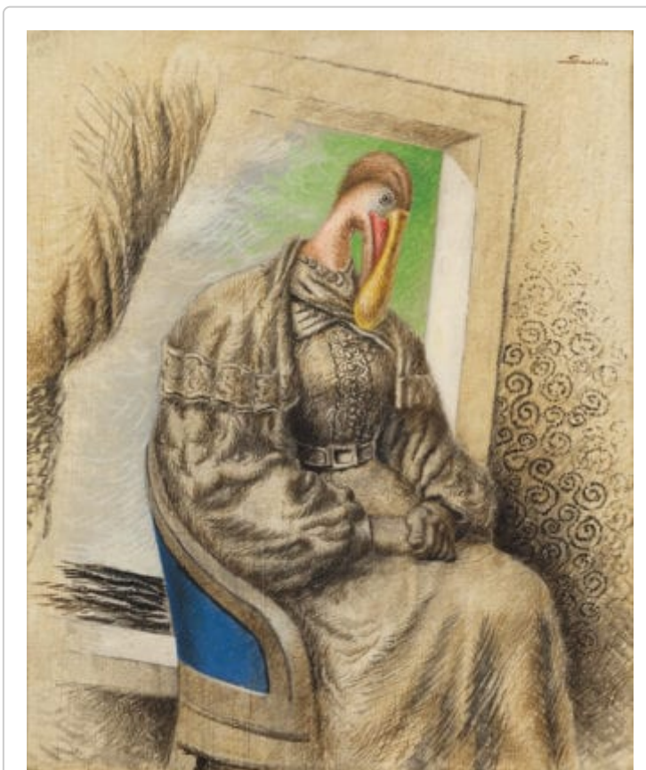
Figure 4. Alberto Savinio, “La vedova” [The widow], 1931. Tempera on paper mounted on canvas, 21 5/8 x 18 1/16 in. (55 x 46 cm). Private Collection. On site at CIMA during exhibition.

Savinio, Alberto. Alceste di Samuele e atti unici . Milan: Adelphi, 1991.