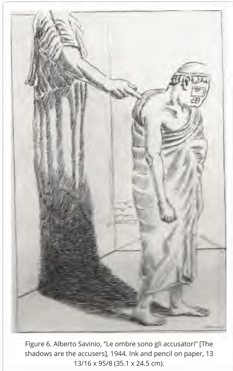
Figure 6. Alberto Savinio, "Le ombre sono gli accusatori" [The shadows are the accusers], 1944. Ink and pencil on paper, 13 13/16 x 95/8 (35.1 x 24.5 cm).

decided to appropriate the nom de plume Savinio in order not to passively endure his destiny, to instead put it under the best auspices, as well as to distinguish himself from his brother Giorgio. He was most likely encouraged by his friend Guillaume Apollinaire, who, for his part, had been born Wilhelm Apollinaris de Kostrowitzky. Savinio first applied his pseudonym upon the publication, in Apollinaire's magazine Les soirées de Paris , of "Le drame et la musique" (The drama and the music, 1914), theoretical prelude for "Les chants de la mi-mort" (Songs of the half-dead, 1914), a series of "dramatic episodes" set in the Risorgimento (he also wrote music and designed sets and costumes for the piece).