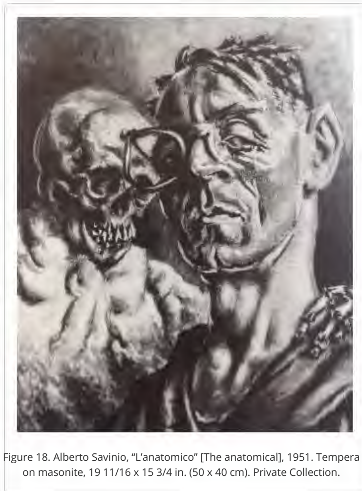
Figure 18. Alberto Savinio, "L'anatomico" [The anatomical], 1951. Tempera on masonite, 19 11/16 x 15 3/4 in. (50 x 40 cm). Private Collection.