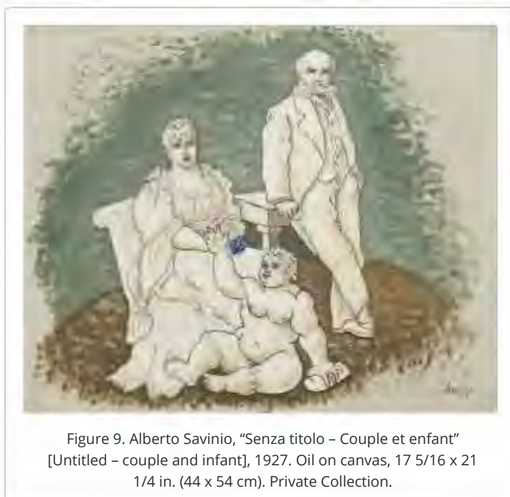
Figure 9. Alberto Savinio, "Senza titolo - Couple et enfant" [Untitled - couple and infant], 1927. Oil on canvas, 17 5/16 x 21 1/4 in. (44 x 54 cm). Private Collection.