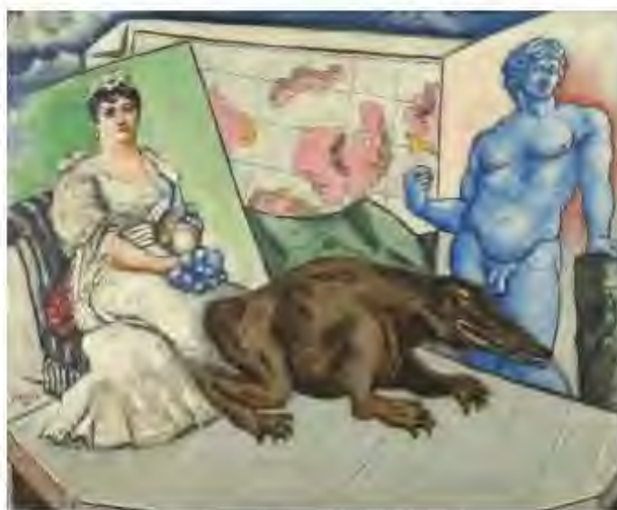
Figure 13. Alberto Savinio, "Atlante" [Atlas], 1927. Oil on canvas, 28 x 35 13/16 in. (71 x 91 cm). Private Collection.