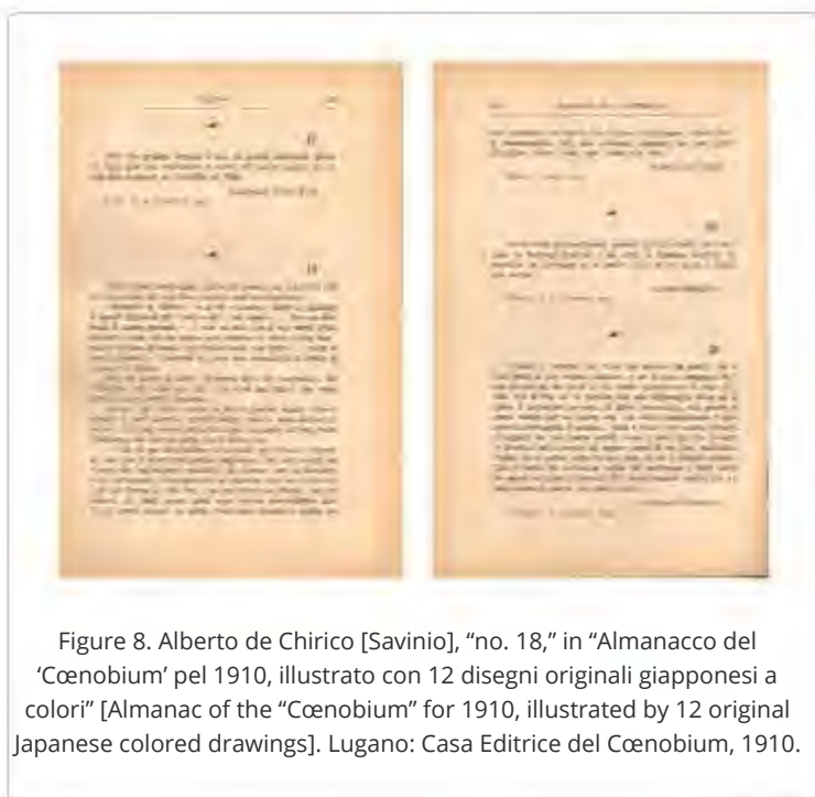
Figure 8. Alberto de Chirico [Savinio], "no. 18," in "Almanacco del 'Cœnobium' pel 1910, illustrato con 12 disegni originali giapponesi a colori" [Almanac of the "Cœnobium" for 1910, illustrated by 12 original Japanese colored drawings]. Lugano: Casa Editrice del Cœnobium, 1910.

Even the concept of half-death is nothing but a manifestation of the duplicity of the human condition and of the relativity of existence, for Savinio understood half-death as the state of clairvoyance that some individuals experience in that limbo of perception that lies between wakefulness and sleep, when the hidden language of things can be captured and their spectral interiority unveiled. Thus understood, half-death relates once again to the Nietzschean idea of time as an "eternal return" and an "eternal present"; it indicates a time suspended between a past – all that no longer exists – and a future – all that has yet to be. Thus death may be metaphorically conceived as a door that can be opened in both directions, making possible a "return" in the form of a "revenant," or ghost, one of the central figures of the metaphysical art.