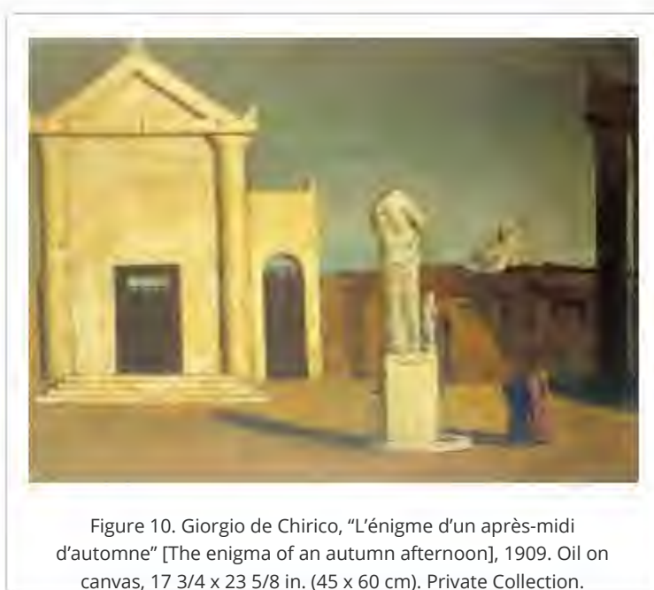
Figure 10. Giorgio de Chirico, “L'énigme d'un après-midi d'automne” [The enigma of an autumn afternoon], 1909. Oil on canvas, 17 3/4 x 23 5/8 in. (45 x 60 cm). Private Collection.

“But is there a difference, basically, from one shadow to another?” asked Savinio, seriously, in a post-World War II piece of writing. 32 The objects, but also the figures, in his paintings appear rather “stripped” of their shadows – for example in the Baconian Atlante (Atlas, 1927; figure 13) or in Senza titolo – Couple et enfant – with the effect of photographic overexposure or collage defeating, as intended by Savinio, “the cloud of chiaroscuro,” thus “to clean them of the rhetoric, theatricality, vulgarity of the carried shadow.”