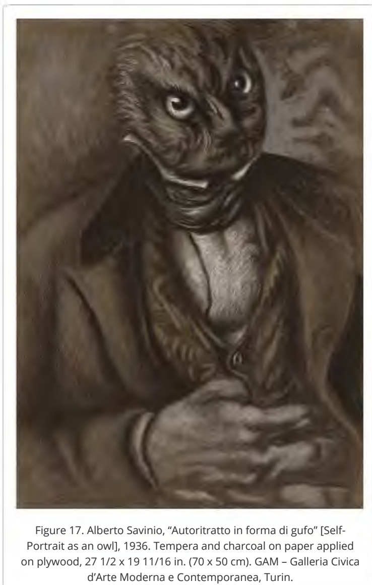
Figure 17. Alberto Savinio, "Autoritratto in forma di gufo" [Self-Portrait as an owl], 1936. Tempera and charcoal on paper applied on plywood, 27 1/2 x 19 11/16 in. (70 x 50 cm). GAM – Galleria Civica d'Arte Moderna e Contemporanea, Turin.

Savinio, Alberto. Ascolto il tuo cuore, città . Milan: Bompiani, 1944.