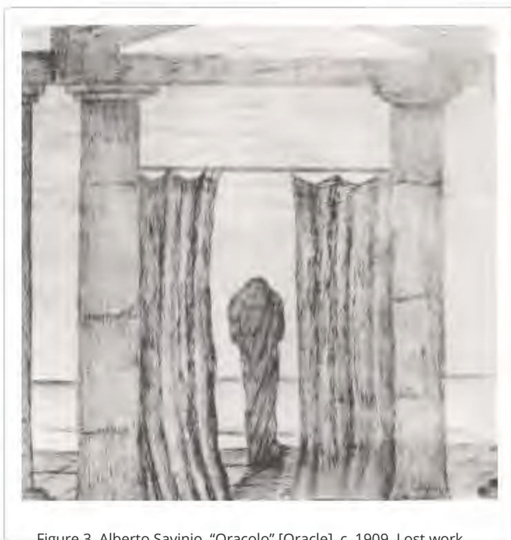
Figure 3. Alberto Savinio, "Oracolo" [Oracle], c. 1909. Lost work.

In Savinio's stories, music, and paintings, there are characters that closely resemble the protagonist – in physiognomy, in bearing, and even in name. Each appears "almost stolen from a mirror," according to Hoffmann's definition. 10 They are so many alter egos in Savinio's works that apparently he lived through the possibility of an other existence, or through the appropriation of another identity. Such "superior beings" are reminiscent of the Nietzschean superman, "beyond good and evil" and transcending all "human, too human" limits. It is important to underline that Savinio, like his brother, was very superstitious. "If a breath touched our face or our hand," he wrote, in recollection