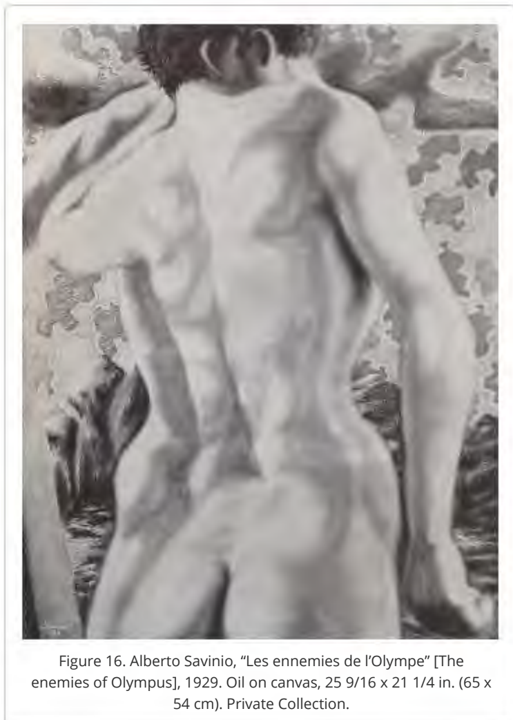
Figure 16. Alberto Savinio, "Les ennemies de l'Olympe" [The enemies of Olympus], 1929. Oil on canvas, 25 9/16 x 21 1/4 in. (65 x 54 cm). Private Collection.

Porzio, Michele. "Deux Amours dans la nuit: Savinio et la naissance du théâtre métaphysique." Revue d'esthétique. Esthétiques en chantier 24 (1993): 93–100.