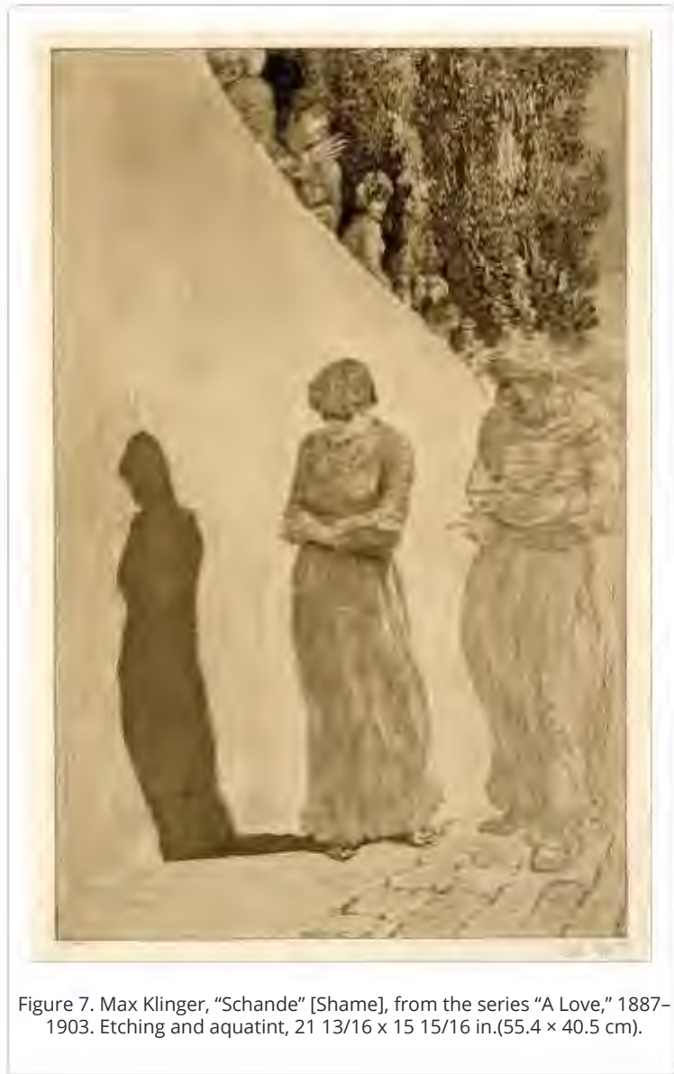
Figure 7. Max Klinger, "Schande" [Shame], from the series "A Love," 1887-1903. Etching and aquatint, 21 13/16 x 15 15/16 in. (55.4 x 40.5 cm).