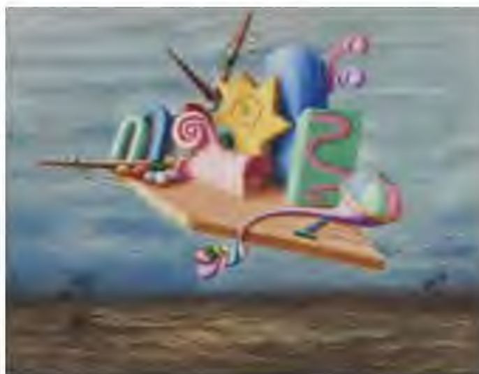
Figure 12. Alberto Savinio, "Les rois mages" [The wise men], 1929. Oil on canvas, 35 1/2 x 46 in. (90 x 117 cm). MART - Museo di Arte Moderna e Contemporanea di Trento e Rovereto.

precisely about the aforementioned Sante Astaldi portrait, "the integrity of this shadow prevails over the ambiguity of the doubling of the self, not altered by the usual interventions of metamorphosis, and the calmness of this protective demon." 34