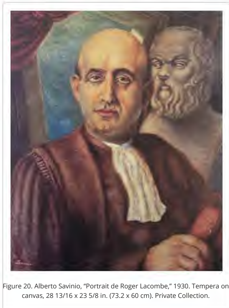
Figure 20. Alberto Savinio, "Portrait de Roger Lacombe," 1930. Tempera on canvas, 28 13/16 x 23 5/8 in. (73.2 x 60 cm). Private Collection.

Vivarelli, Pia, ed. Alberto Savinio: dipinti 1927- 1952 . Milan: Electa, 1991. Exhibition catalogue.