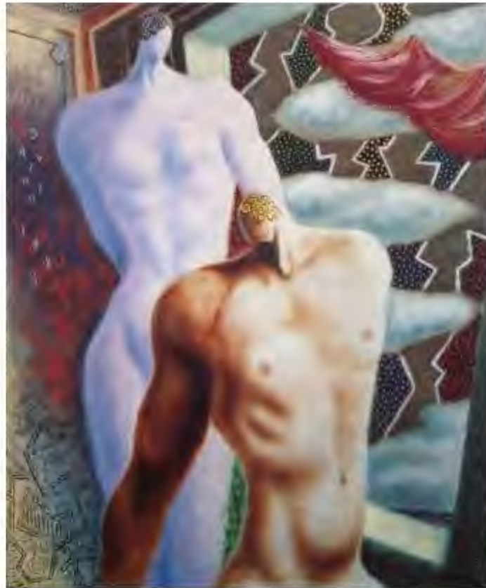
Figure 14. Alberto Savinio, "Les Dioscures" [The Dioscuri], 1929. Oil on canvas, 25 1/2 x 21 5/6 in. (64.7 x 54.1 cm). Private Collection.

De Chirico, Giorgio. "Sull'arte metafisica." Valori plastici 1, nos. 4–5 (April–May 1919). Reprinted in De Chirico, Il meccanismo del pensiero: critica, polemica, autobiografia, 1911–1943 , edited by Maurizio Fagiolo dell'Arco, 83–88. Turin: Einaudi, 1985.