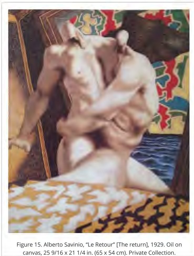
Figure 15. Alberto Savinio, "Le Retour" [The return], 1929. Oil on canvas, 25 9/16 x 21 1/4 in. (65 x 54 cm). Private Collection.

Landini, Carlo Alessandro. Lo sguardo assente. Arte e autismo: il caso Savinio. Milan: Angeli, 2009.