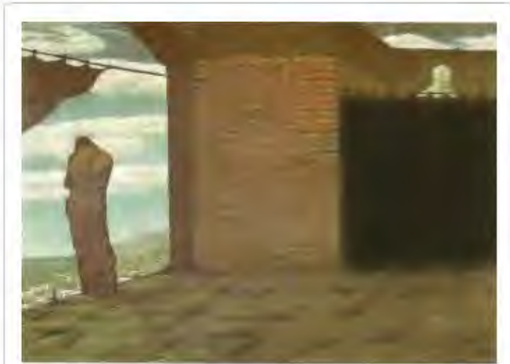
Figure 2. Giorgio de Chirico, "L'enigma dell'oracolo" [The enigma of the oracle], 1909. Oil on canvas, 16 1/2 x 24 in. (42 x 61 cm). Private Collection.

1944), clearly taken from the artist Max Klinger, who was an important inspiration to the brothers. In Klinger's etching Schande (Shame, 1887), for example, only the woman marked by shame casts the blackness of herself onto the wall (figures 6–7).