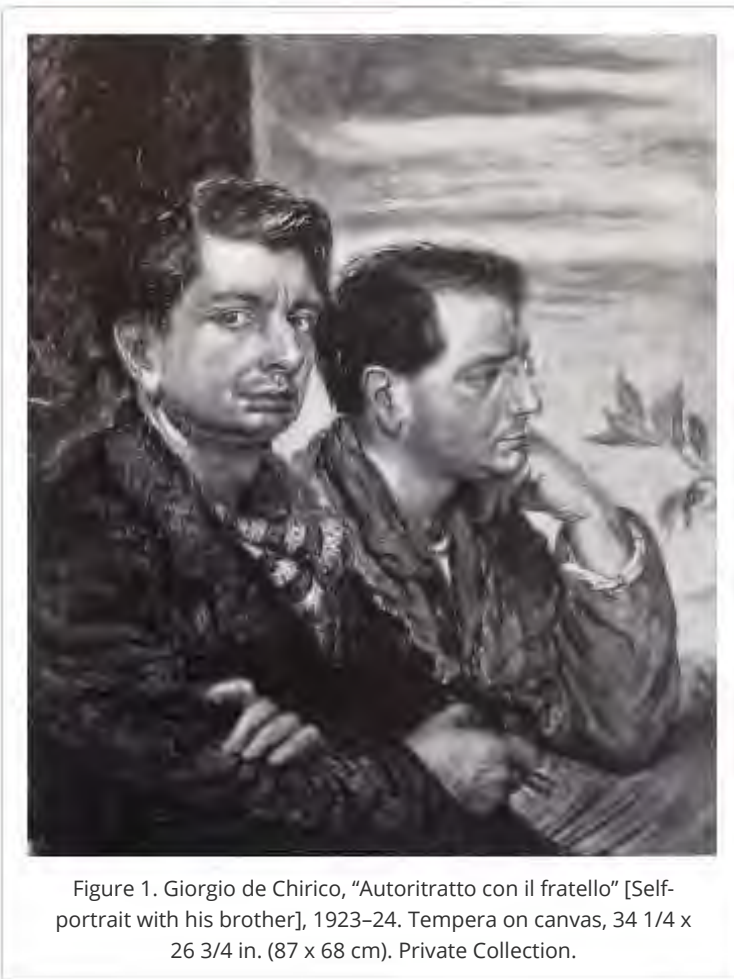
Figure 1. Giorgio de Chirico, "Autoritratto con il fratello" [Self-portrait with his brother], 1923–24. Tempera on canvas, 34 1/4 x 26 3/4 in. (87 x 68 cm). Private Collection.

At times it was a ghost or life force capable of passing from one state to another while preserving the memories and feelings of earthly life; at others it was a conscience, at once angelic and diabolical, expressive of the darkest, scariest sides within us. In this regard, there is a disquieting illustration by Savinio of Lucian's dialogues, Le ombre sono gli accusatori (The shadows are the accusers,