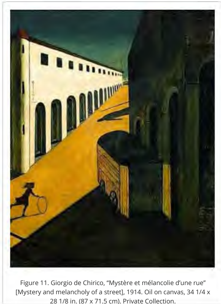
Figure 11. Giorgio de Chirico, "Mystère et mélancolie d'une rue" [Mystery and melancholy of a street], 1914. Oil on canvas, 34 1/4 x 28 1/8 in. (87 x 71.5 cm). Private Collection.

In his later images, and especially in the portraits of the late thirties and forties, in proximity to the Second World War, the double conveys an increasingly declared intellectual discomfort. It oscillates between, on the one hand, the incommunicability of different personality traits and the loss of an individual's identity and vanity, and, on the other, the impermanence of the whole, as can be seen in contemporaneous writings by Savinio. Particularly relevant here is the penetrating Autoritratto in forma di gufo (Self-portrait as an owl, 1936; figure 17),