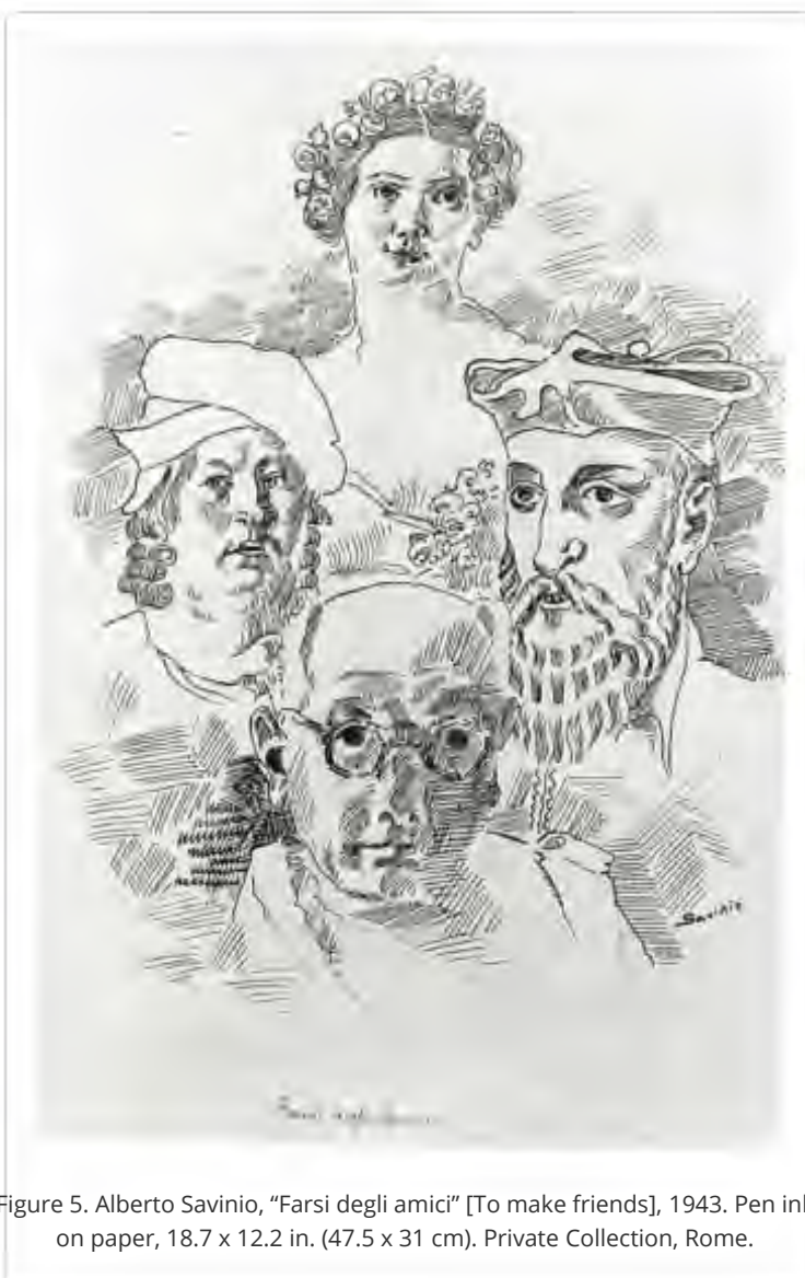
Figure 5. Alberto Savinio, "Farsi degli amici" [To make friends], 1943. Pen ink on paper, 18.7 x 12.2 in. (47.5 x 31 cm). Private Collection, Rome.

very same year in which Savinio's drawing Farsi degli Amici was exhibited in Rome on the occasion of Savinio's retrospective, the title was significantly appropriated by Clemente for his own rendition of Farsi degli Amici (1978). Following Savinio's group portrait, the artist marked out his own four kindred spirits, denoted by emblematic figures and their corresponding names: "Talete" (Thales), "Epimenide" (Epimenides), "Lao-Tze," and "Kwang-Tze" are credited side by side; Savinio stands next to them, though in watermark. In fact, the writer's presence is to be felt in noting the position he covered in the intellectual landscape and philosophical discourse promoted by Adelphi's cultural project. With it the reader is invited to make a pilgrimage to a geographical and mental territory, and to explore the stance assigned to Savinio on a metaphysical and mystical horizon. Its editorial pendulum had in fact swung, in 1973, to the release of a translated version of the Chinese text Tao tē ching: il libro della via e della virtù (The book of the way and its virtue by the Lao Tze), 19 and then to the 1978 publication of Giorgio Colli's La sapienza greca (The Greek wisdom), which includes Thales and Epimenides in its second volume. 20 Along this journey the reader would next encounter, in 1975, Savinio's