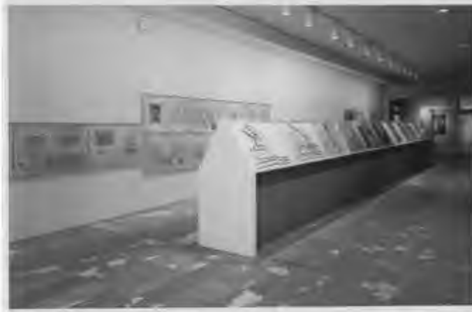
Figure 1. Installation view of the exhibition, "Clemente: Departure of the Argonaut". November 6, 1986–February 10, 1987. The Museum of Modern Art, New York. Gelatin silver print, 6 x 9 in.(15.2 x 22.9 cm).

In this regard, the painter reacts to the Argonaut's journeying with variations and combinations. In correspondence with the third chapter, for instance, we will encounter a multilayered depiction/invention in which Clemente monumentalizes Pinocchio, of whom Savinio wrote of feeling bound to in the brotherhood of unfortunate adventurers. Further, the embedding of architectural elements encompasses Savinio's story of the search, on his arrival at Taranto, for the kind of "municipal place in every city whose fame precedes it, and which attracts the arriving traveler like a magnet (St. Peter's in Rome, The Eiffel Tower in Paris, the Statue of Liberty in New York, el palacio del gobernador in Mexico City), and which in this