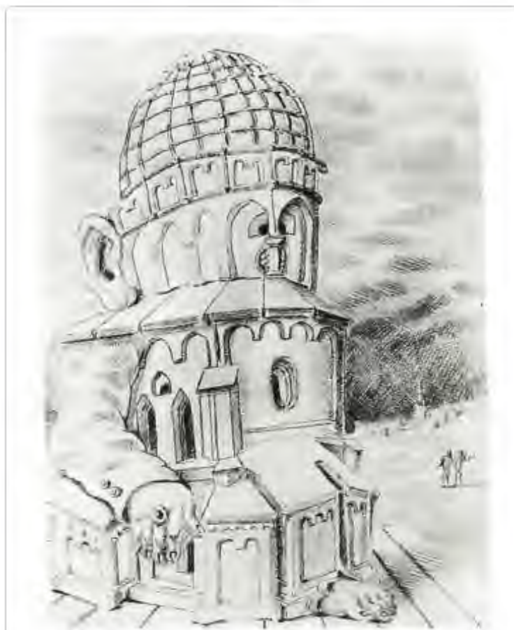
Figure 3. Alberto Savinio, "Cupoluomo," (1946). Pencil on paper glued on cardboard, 10.6 x 7.9 in. (27 x 20 cm). Udine, Musei Civici Galleria d'Arte Moderna, Astaldi Collection.

The drawing was published in 1948 in Domus magazine along with a commentary in which he explains the hybridity and the symbolic value of the dome. The work was on view on the occasion of the artist's retrospective in 1978, and Clemente may have been receptive to the image in many ways, for he had come to Rome to study architecture, and also in light of the text as reprinted under the heading "Cupola" in Savinio's collection Nuova enciclopedia (New encyclopedia), published by Adelphi in 1977 and titled after the homonym column curated by Savinio in Domus from January 1941 to December 1942. 13