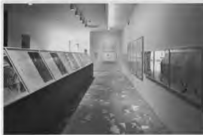
Figure 2. Installation view of the exhibition, "Clemente: Departure of the Argonaut". November 6, 1986–February 10, 1987. The Museum of Modern Art, New York. Gelatin silver print, 6 x 9 in.(15.2 x 22.9 cm).