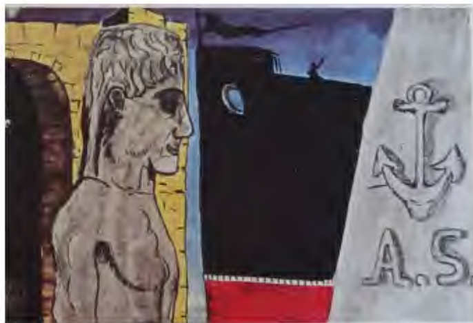
Figure 4. Alberto Savinio, "Le Départ des Argonautes" [The Departure of the Argonaut] (1925–26). Cardboard and tempera on paper, 5.9 x 8.7 in. (14.2 x 22 cm). Private Collection, Rome.

As a result of an exploration further undertaken in the realm of symbolic portrayal, which implies research into both the sign and the self, Clemente's most evident statement – the clearest anyway – is to be found hidden at the end of the book, in the last folio: a signature in the shape of a heraldic emblem. He meticulously retraced