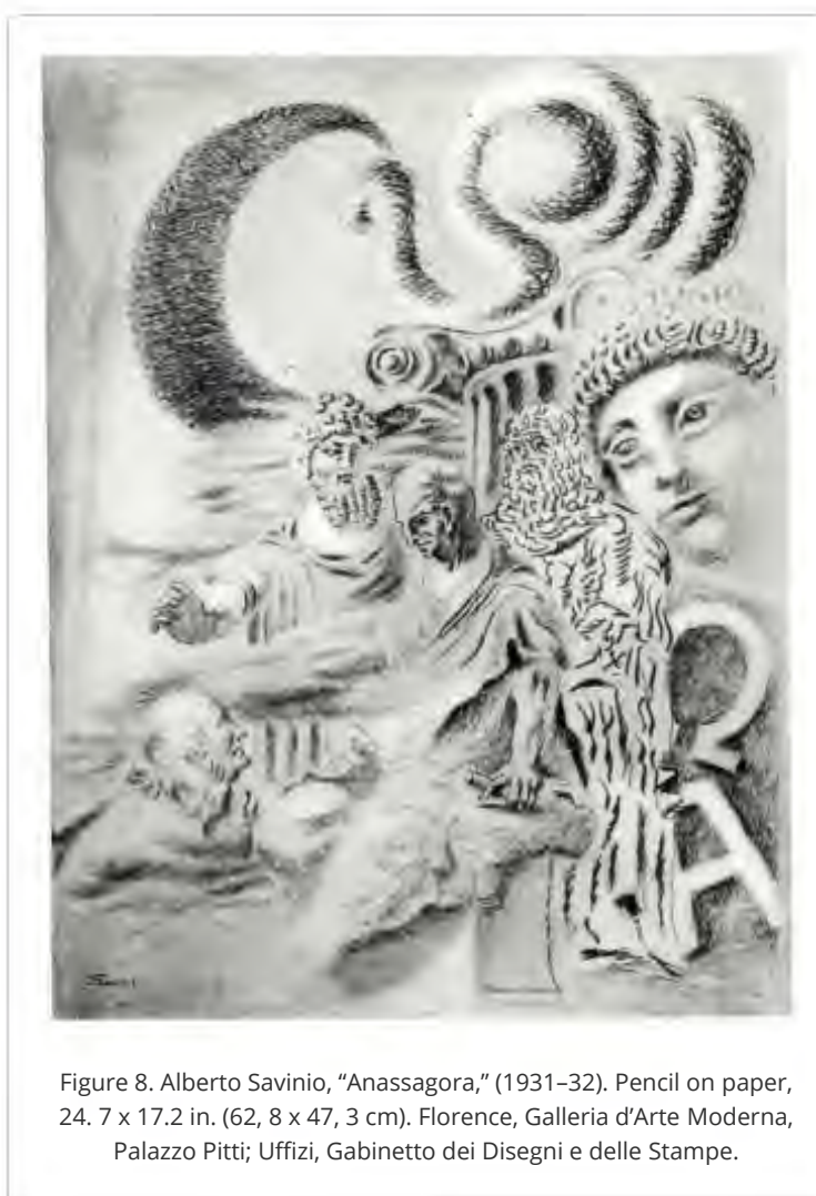
Figure 8. Alberto Savinio, "Anassagora," (1931–32). Pencil on paper, 24. 7 x 17.2 in. (62, 8 x 47, 3 cm). Florence, Galleria d'Arte Moderna, Palazzo Pitti; Uffizi, Gabinetto dei Disegni e delle Stampe.

Clemente, Francesco. Francesco Clemente: affreschi, pinturas al fresco . Madrid: Fundación Caja de Pensiones, 1987. Exhibition catalogue.