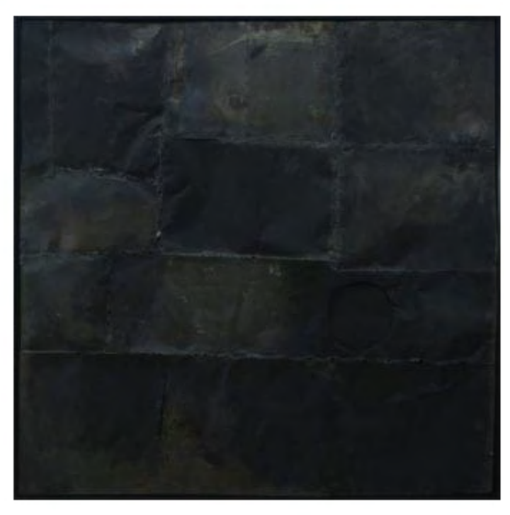
Figure 4. Alberto Burri, "Grande Ferro M1," 1958. Welded iron with paint and nails, 78 3/8 x 79 in. (199 x 31 1/8 cm). Mildred Lane Kemper Art Museum, Washington University in St. Louis. Gift of Joseph Pulitzer, Jr., 1963. © 2019 Artists Rights Society (ARS), New York / SIAE, Rome.

The early date of Pulitzer's attention to contemporary Italian art is noteworthy. He began buying these works when U.S. market interest was in its initial stages. The purchase of Italian art would have