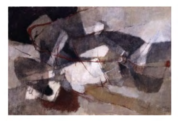
Figure 6. Afro, "Terra di Quercia" [Land of oaks], 1956. Oil on canvas, 39 1/4 x 59 in. (99.7 x 149.8 cm). Mildred Lane Kemper Art Museum, Washington University in St. Louis. Gift of Joseph Pulitzer, Jr., 1966. © 2019 Artists Rights Society (ARS), New York / SIAE, Rome.

Pulitzer continued to acquire Italian works after 1955, such as a painting bought in 1958 directly from Birolli (Memoria del Veneto [Memory of the Veneto], 1957; figure 7) and gifted to the Washington University Gallery of Art in 1962, and Caruso's The Factory (1958) which he purchased from leffress in London in 1958 via the Galleria dell'Obelisco in Rome, after the work had