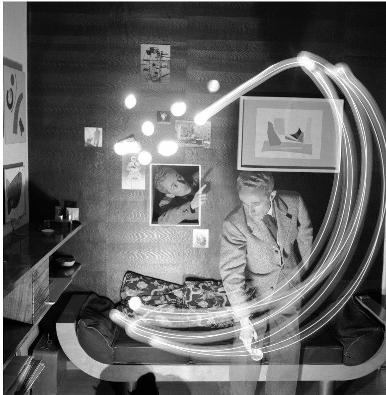
Bruno Munari nella sua abitazione, Milano, 1950