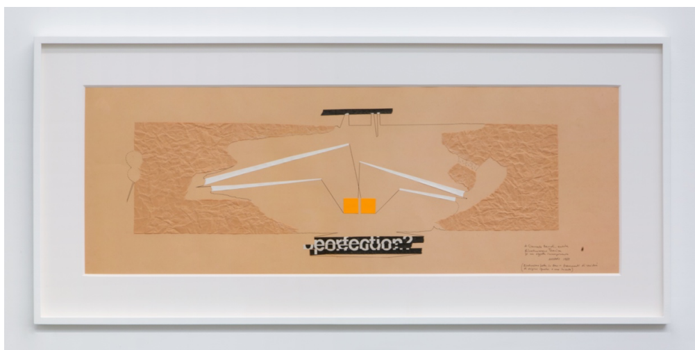
Ricostruzione teorica di un oggetto immaginario (1969).